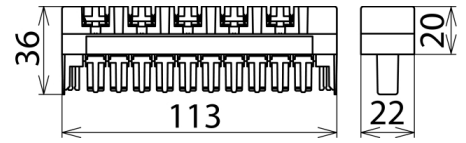
Dimension drawing BM 10 DRL

Plug-in SPD block (without SPDs) for 1 to max. 10 three-pole GDT 230 B3 ... gas discharge tubes. Also suitable for DRL protective plugs with earthing frame.